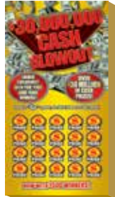
TICKET PACK EXAMPLE

FOLLOW THE INSTRUCTIONS BELOW ON HOW TO LOAD TICKETS INTO THE MAXIMUM SALES DRIVER DISPLAY.