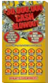
TICKET PACK EXAMPLE

FOLLOW THE INSTRUCTIONS BELOW ON HOW TO LOAD TICKETS INTO THE MAXIMUM SALES DRIVER DISPLAY.